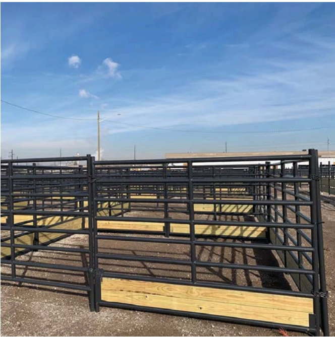
View of new pens

*Variety of sizes for both day and night pens