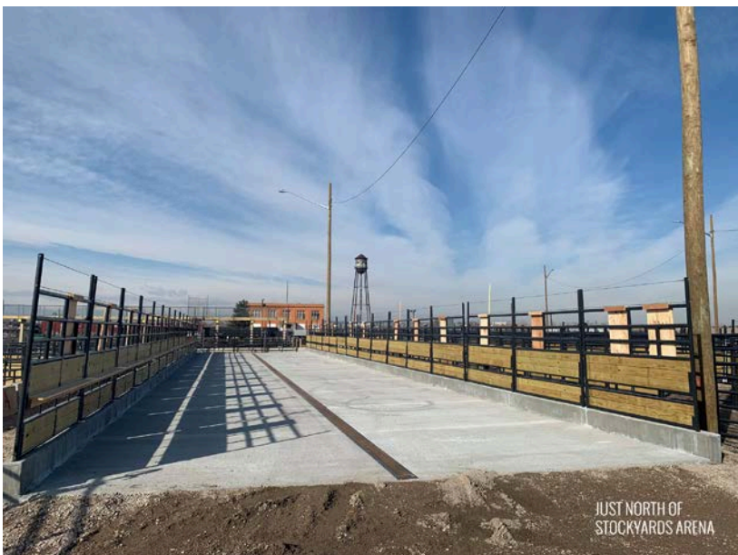
1 of 3 wash racks available

*Variety of sizes for both day and night pens