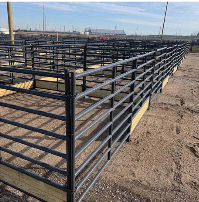
View of new pens

*Variety of sizes for both day and night pens