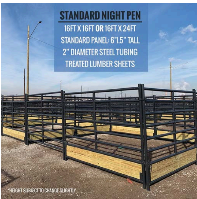
Standard Night Pen